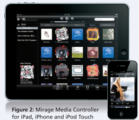
Figure 2: Mirage Media Controller for iPad, iPhone and iPod Touch