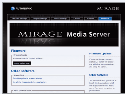
Figure 1: Remote Configuration Utility. For optimal performance and current features, install the latest firmware on your MMS-2 from the Firmware tab.